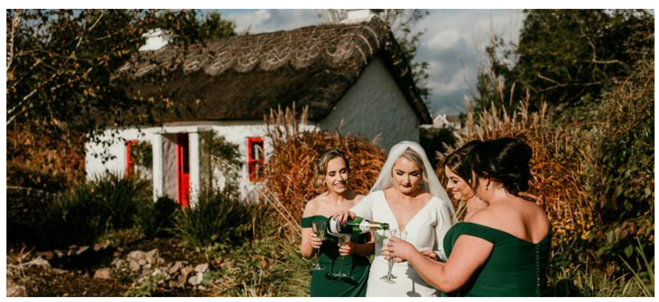
Your perfect photo location, just a few minutes drive from the hotel. Exclusive to you on your Wedding Day